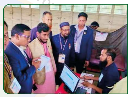
EMF Observer Team observing Sylhet City Corporation Election.