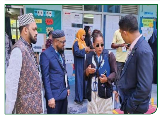
Election Monitoring Forum Team during Maldives Presidential Election.