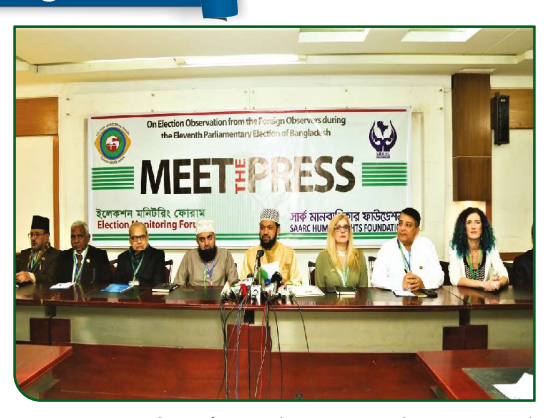
EMF press breifing during 11th National Parliament Election.