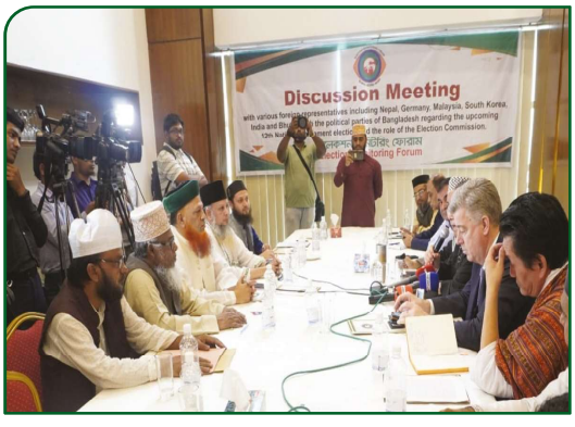
Foreign Observers of EMF exchanging views with central leaders of The Islami Front Bangladesh