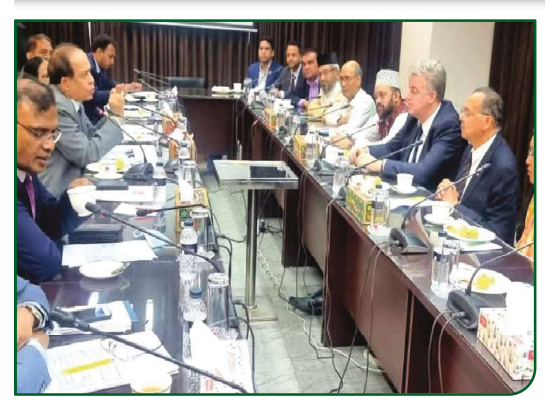
First team of International Observers of Election Monitoring Forum exchaning views with Bangladesh Election Commission.