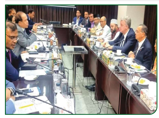
First team of International Observers of Election Monitoring Forum exchaning views with Bangladesh Election Commission.