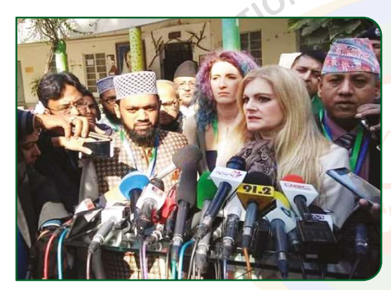
Foreign Observers speaking with the press on election day.