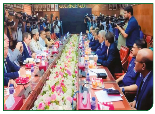
International Observer of EMF exchanging views with Honorable Home Minister of Bangladesh Mr. Asaduzzaman Khan Kamal.