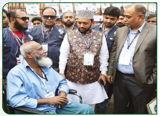
EMF Election Observers speaking with voters during 11th National Parliament Election.