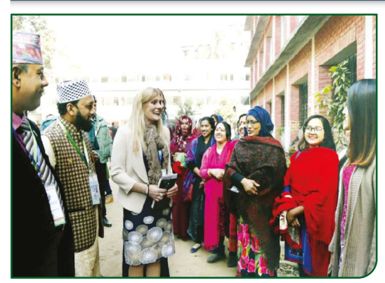
Foreign Observers of EMF speaking with voters on election day during 11th National Parliament Election.