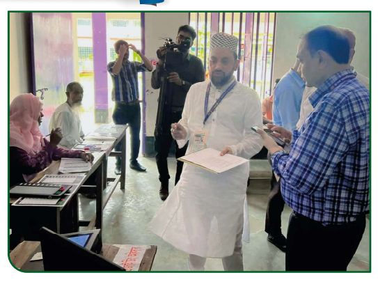
EMF Chairman and Team observing Barisal City Corporation Election.