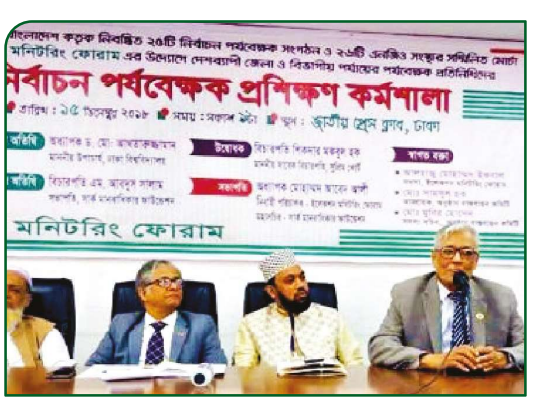
Observer Training organized by Election Monitoring Forum